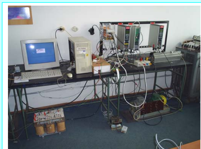
In the Electric Drives Laboratory