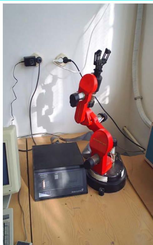
A Robot Arm driven by Internet