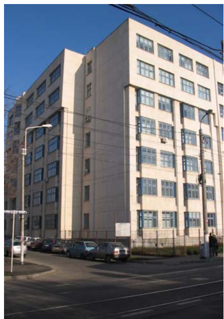
Building Y - The main building of the faculty

Short history: Electrical engineering, as teaching and research activities, has more than 30 years old at the "Dunărea de Jos" University of Galați. The 1978 year was the start point of the doctoral studies and school in the electrical engineering field. In 1990 was founded the Electrical Engineering and Ships Faculty. A new faculty was organized in 2002, with the name of the Faculty of Electrical Engineering and Computer Science. In 2004 the faculty has been reorganized and the actual name is the Faculty of Electrical and Electronics Engineering.