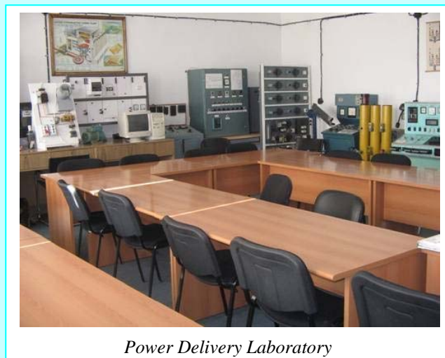
Power Delivery Laboratory